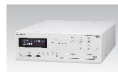
HVO-3000MT 3D HD Video Recorder