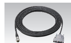
CCMC-T20/CCMC-T15/ CCMC-T10/CCMC-T05 Camera Cables