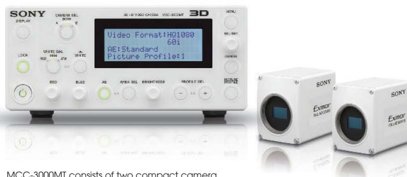
MCC-3000MT consists of two compact camera heads and one CCU (Camera Control Unit)