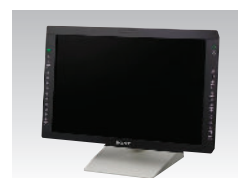
LMD-2451MT 3D HD Medical Monitor

Optional microscope adapter kits for stereoscopic 3D